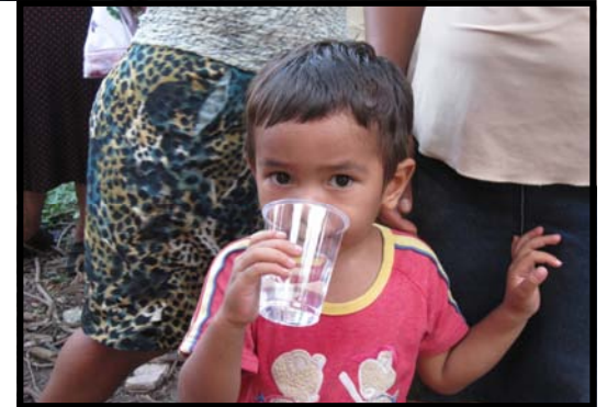
We can see just how much they are enjoying their water.